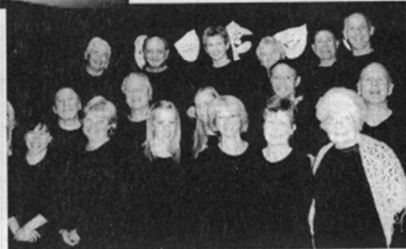
The whole Cast !

Lyminge Guides have designed their own Christmas Cards this year! They are raising money to help pay for a trip to Switzerland in 2009