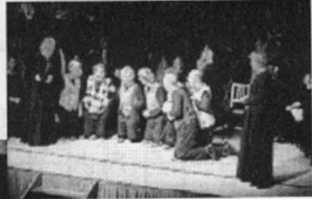
Lyminge Dramatic Society's production of several of the Tales of the Brothers Grimm left the audience enthralled - did you miss it ??