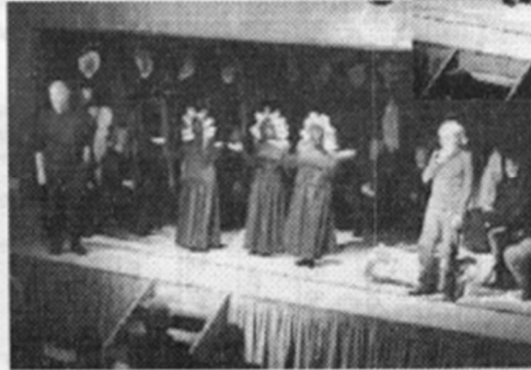
Did you find the answer to the Riddling Tale ? It is on page 8 !