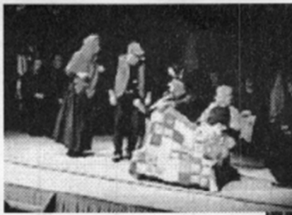
Little Red Cap - with the evil wolf!