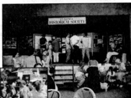
The Lyminge Historical Society display in the Hall inspired interest in local history!