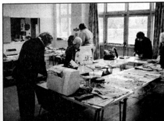
In Action ~ Ethelburga Quilters meet at Etchinghill Village Hall once a month. Did you see their rainbow display in Lyminge Parish Church?