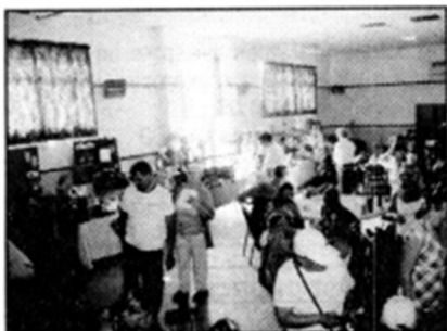
A brisk trade inside the Hall and a remarkable display from the Chinese Lion Dancers outside

A Selection of the photos received of events that have taken place in the last few weeks