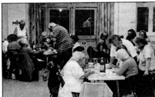
A Quizzical Night at Etchinghill Village Hall. The winning team was 'The Troublemakers' and over £150 was raised for the Hall.

If you have any photographs of local events that could be included in the Newsletter please contact our Newshound via 01303 862328