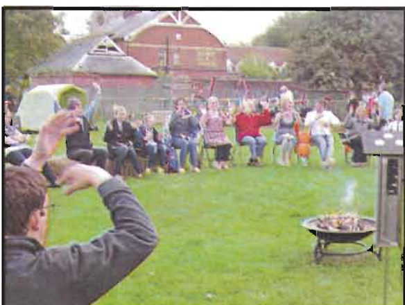
◀ The Camp Fire Finale , provided by Lyminge Guide and Scout Leaders and Guides rounded off what was, judged by many, a perfect day - even the weather was great !