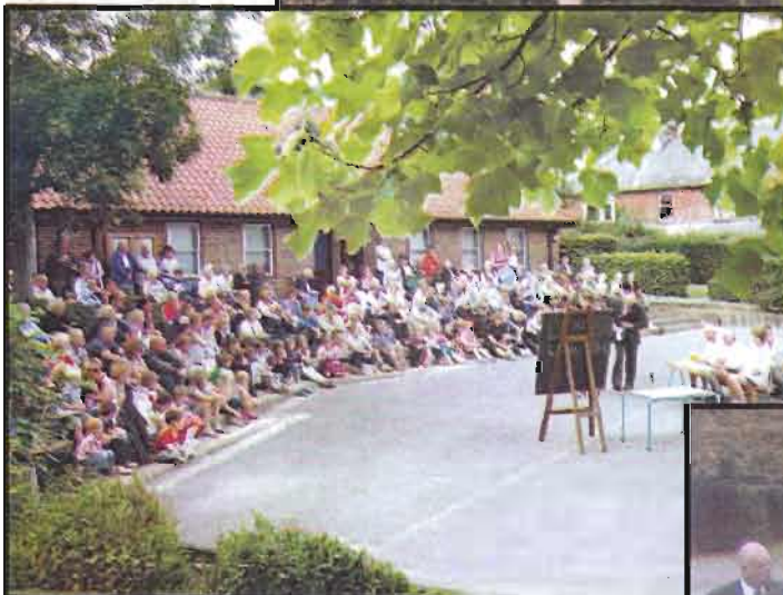
The Lyminge Dramatic Society's playlet attracted a huge audience