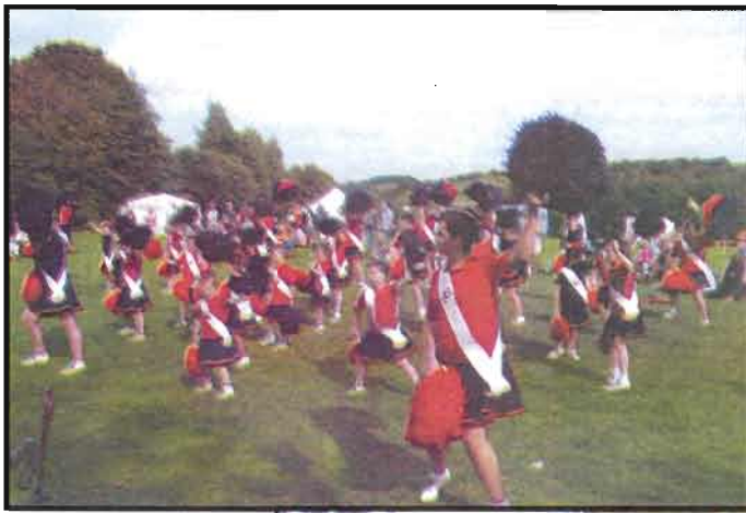
↑ The Hawkinge Flyers gave a marvellous display of their skills. As always they were an immaculately turned out team