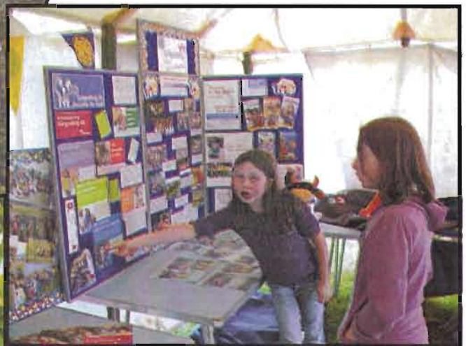
↑ The Lyminge Guides display highlighting the 100 Years of Girlguiding which was also celebrated this year.