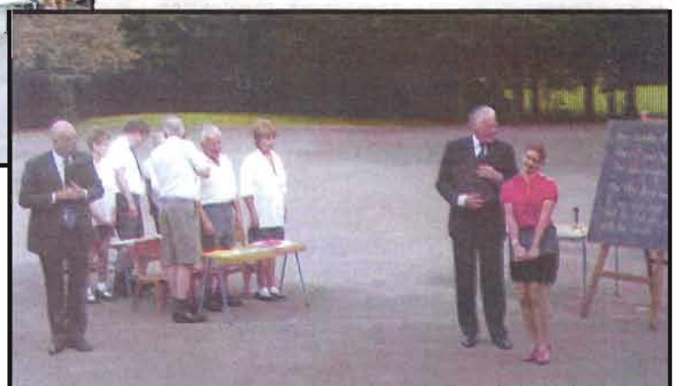
↑ "A Ring in Time" told the story of how a valuable ring came to be lost against the backdrop of a visit by a School Inspector. A very amusing tale, well written, acted and very well received by the audience. Congratulations to all those involved.