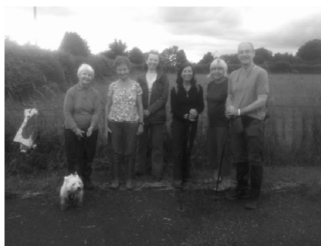
and for a photo on a gloomy one...

For many years now there has been a Parish Walk every month. Led by a local volunteer, the walk takes place on varied local footpaths staying away from the roads as far as possible.