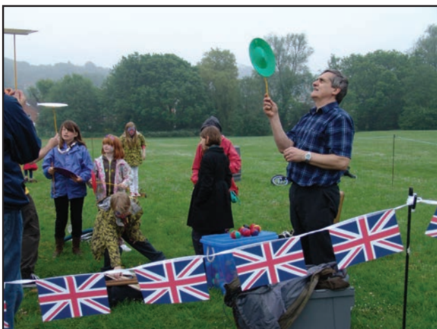
Lyminge Association Chairman tries spinning a plate !