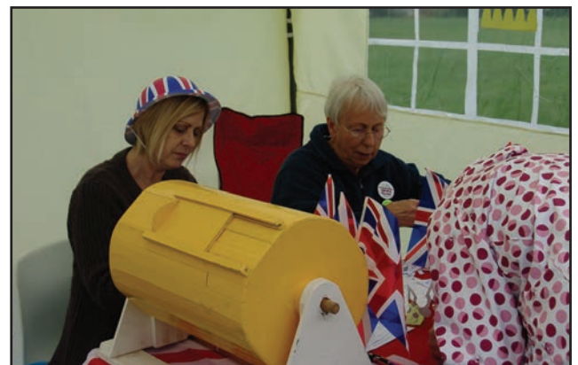
The Grand Draw sold out on the day