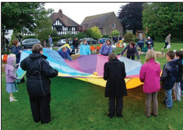
An interactive event ! Lyminge Guides with a coloured parachute

It may have drizzled but when Lyminge wants to celebrate the weather will make little difference !