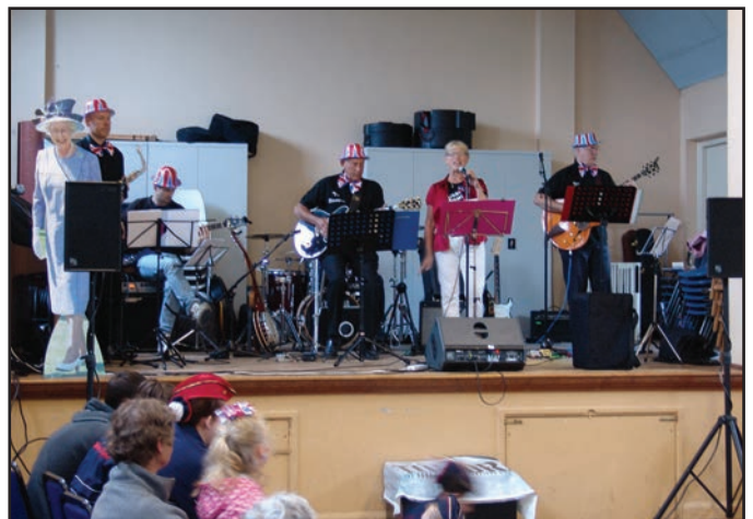
The Stompers performing in the Tayne Centre