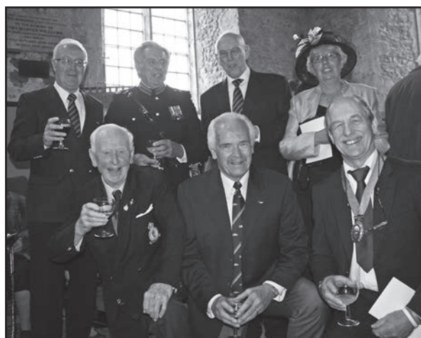
After the Jubilee Civic Service in the Parish Church with the Deputy Lieutenant of Kent

Do you have any photos of local events or local groups in action, please call 01303 862699. Give your group a FREE plug !