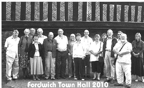
Some Society members at the visit to the ancient Town Hall at Fordwich in July 2010

The Society was formed in 1971 to promote and study the history of Lyminge and the surrounding area. We hold a series of talks during the year as well as organising short visits to local places of historical interest and an annual day trip - see below. When held, talks occur at 7:45pm on the first Tuesday of the month in the Tayne Centre . We always welcome new members and visitors. We sponsor the Lyminge Family History Group where members meet to help each other with their family history research. The Society also maintains an ever-expanding local archive that can be accessed on request.