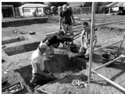
The hard work begins.....