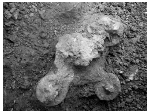
An important find: possibly a decorated horse harness fitting or mount