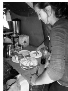
Volunteers: washing .....and sorting the finds .....and providing the cakes.... For more information about this year's Dig refer to the blog at www.lymingearchaeology.org/blog