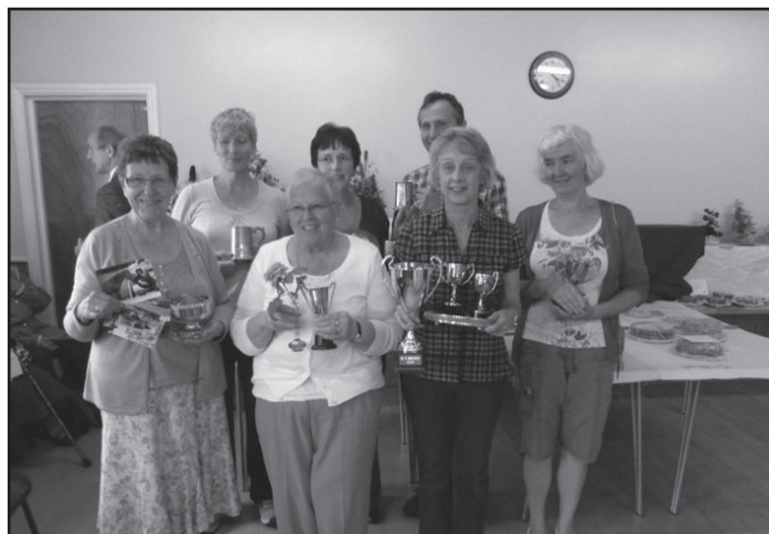
➤ The Rhodes Minnis Flower Show took place on 17th August at Rhodes Minnis Village Hall. Congratulations to all the trophy winners pictured here.