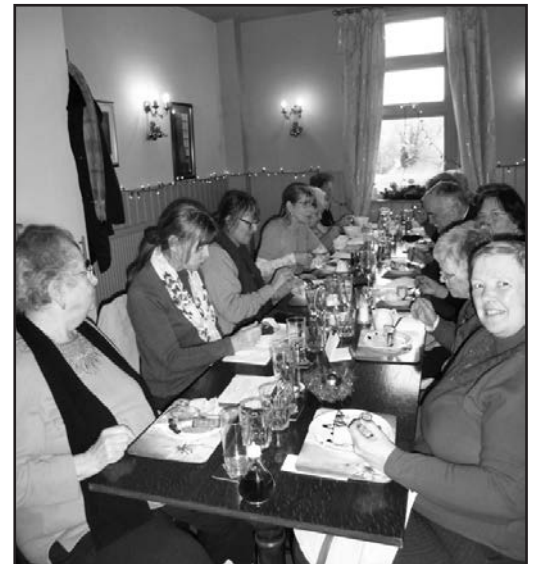
▲ Another celebratory meal for Lyminge Friends - this time at the Coach & Horses.