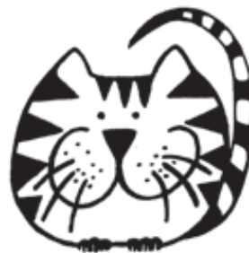
Table Top Fair

Rhodes Minnis Cat Sanctuary 01303 862243