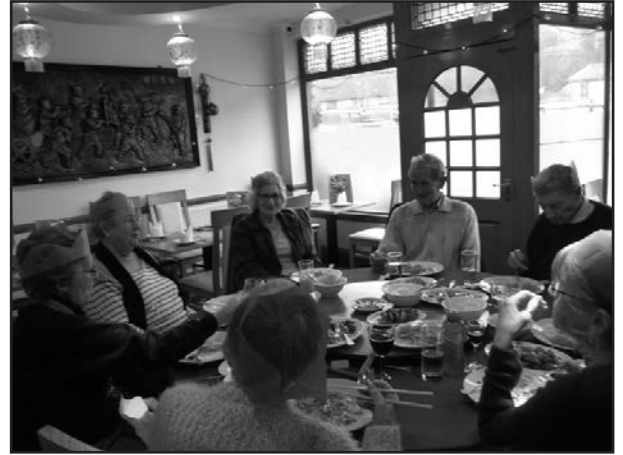
▲ Lyminge Friends celebrating New Year's Eve at China China.