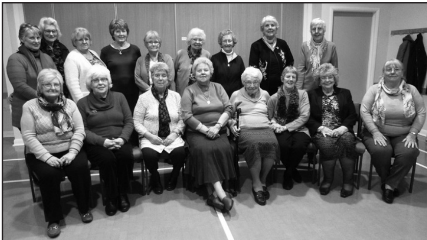
▲ The final meeting of the Etchinghill W.I. which has had to close after 94 years of existence. A very sad day for all the members.