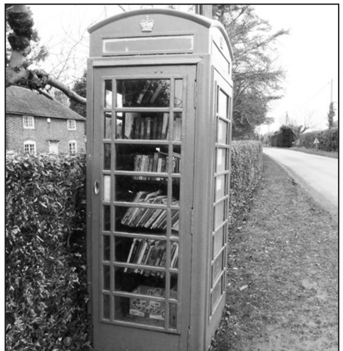
▲ The old telephone box at Rhodes Minnis which was recently purchased by the Parish Council now has a new lease of life as a miniature library!

Have a go at this one - where have you seen these bars?