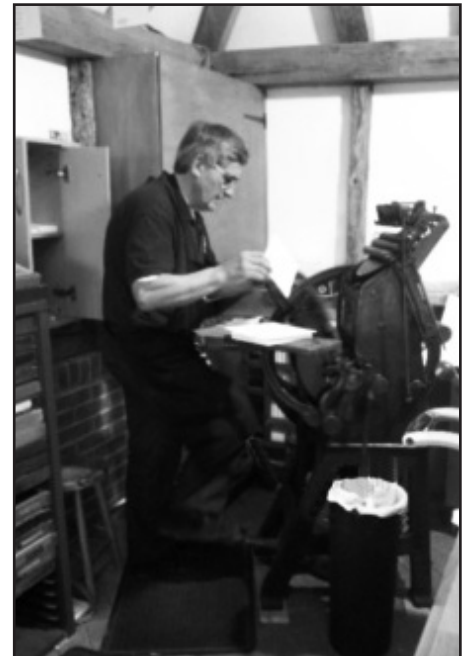
▲ The 100 year old printing press in action at The Elham Valley Line Trust which opened for the new season on Saturday 24th March. You can even have a go yourself with one of the hand-operated presses when the Print Shop is open - usually one day each weekend during the season.