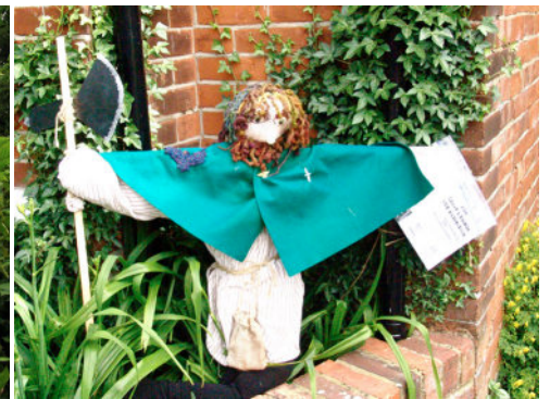
Some of the various works of art from the GREAT LYMINGE ART EXHIBITION